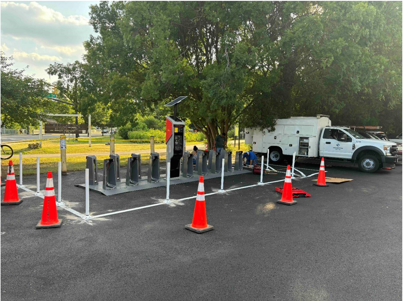
Flexible bollards installed around the new Columbia Pike & W&OD trail station. Traffic cones delineate the work zone.

street from Goodwill and a bus rapid transit stop, the station makes shopping and transfers to other modes of transit seamless and convenient.